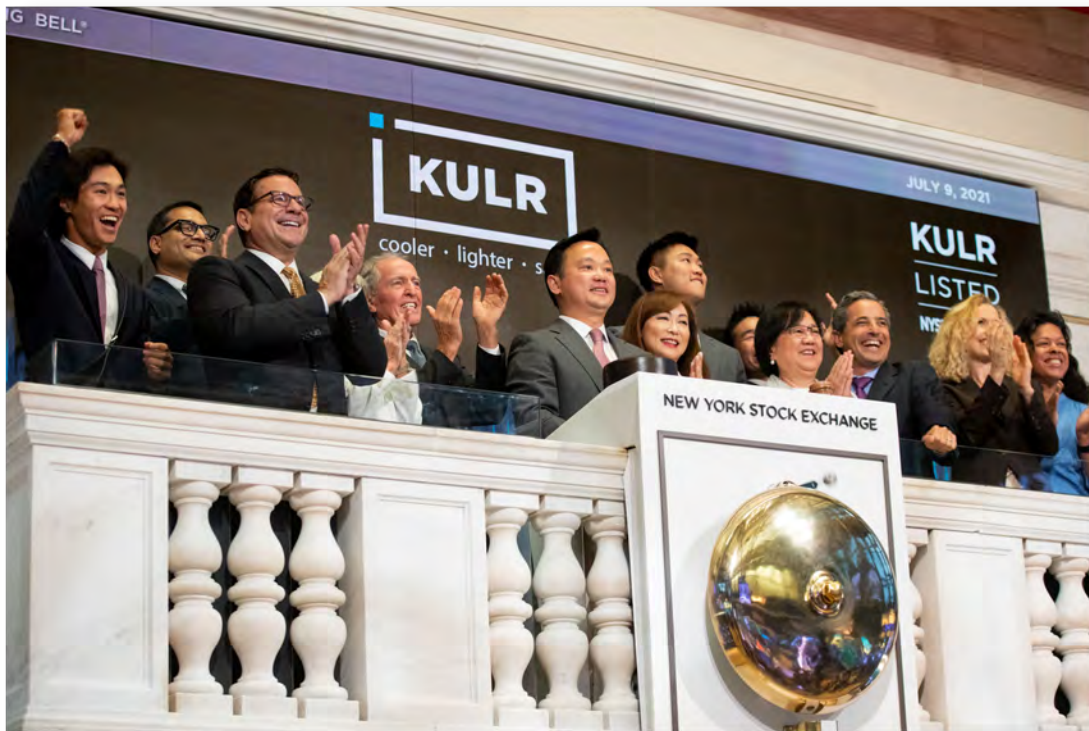
KULR Team Rings NYSE Closing Bell on July 09, 2021

Finally, marking a symbolic end to an eventful second quarter, KULR was invited to ring the NYSE closing bell on July 9th. It was truly an honor to mark the beginning of our next chapter as a publicly traded company by ringing the closing bell at NYSE. We couldn't be more excited about our prospects serving the world of e-mobility, battery transportation, and energy storage products at a time when the world is clamoring for more sustainable ways to work and live.